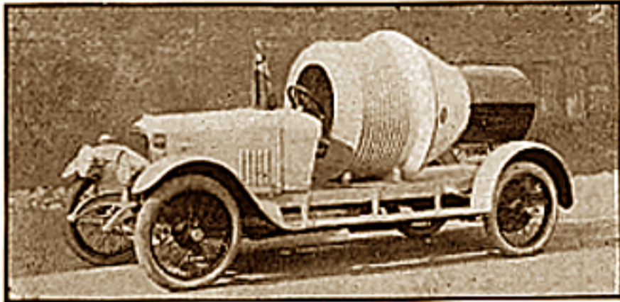
A VAUXHALL CAR with a "Peace" shell case at celebrations in Luton.