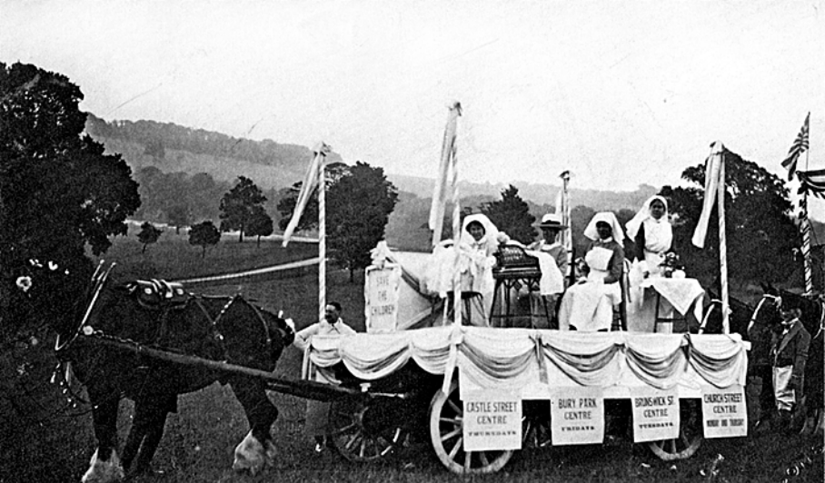
PEACE DAY PAGEANT AT LUTON.