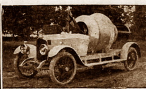
B. Yonkers; "Fog No. 100."