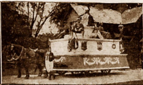
A. Club Car; "Demolition."